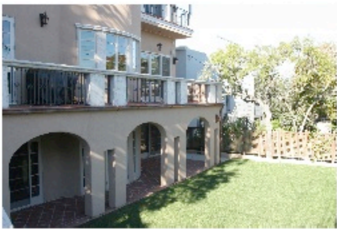
The back yard of the hillside site was excavated to a full level below the street.