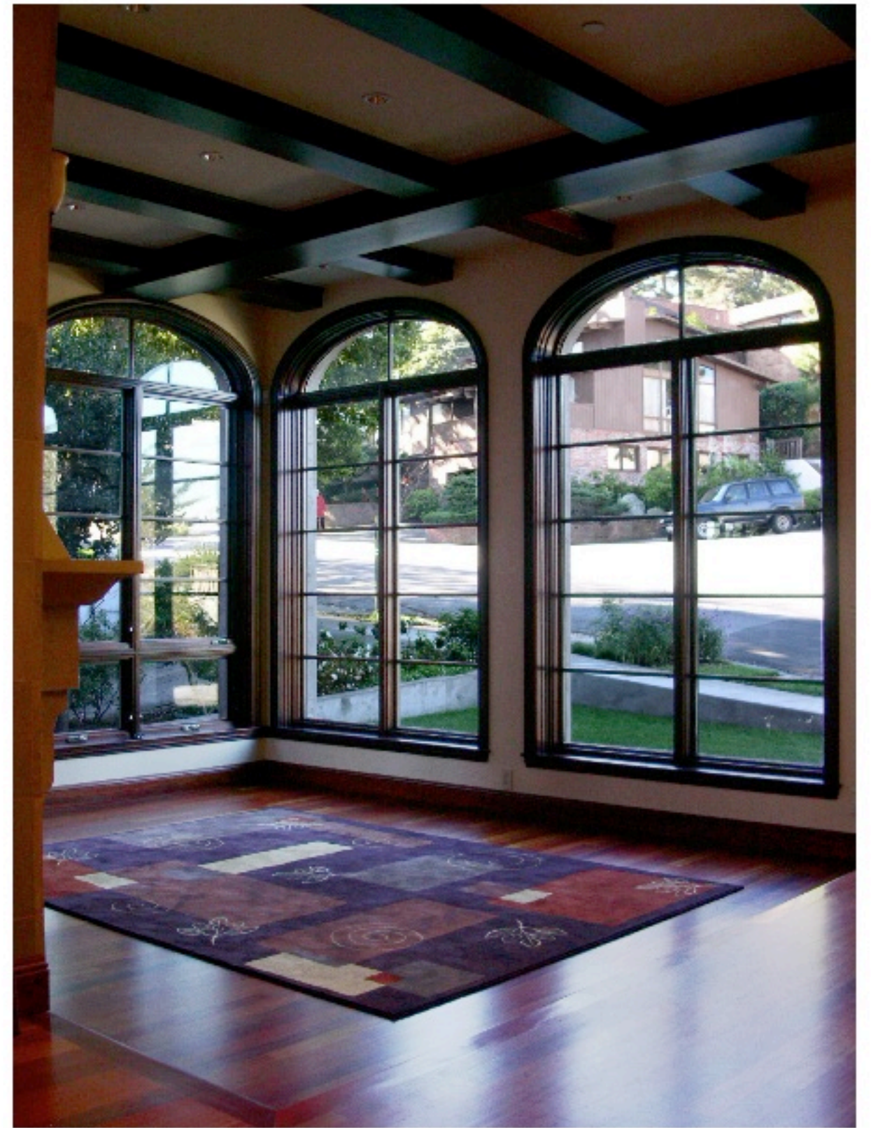
Heat from solar panels in the roof radiates to interior spaces through the hardwood floors