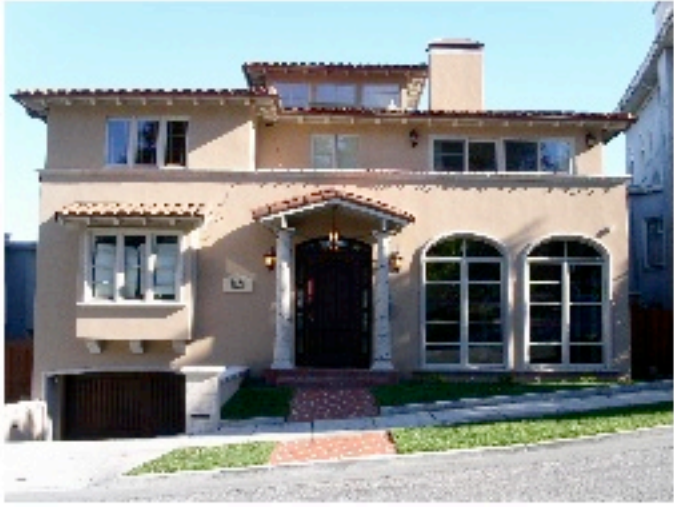
In front, the scale of the house is in keeping with the neighborhood originally laid out by Bernard Maybeck early in the 20th century.