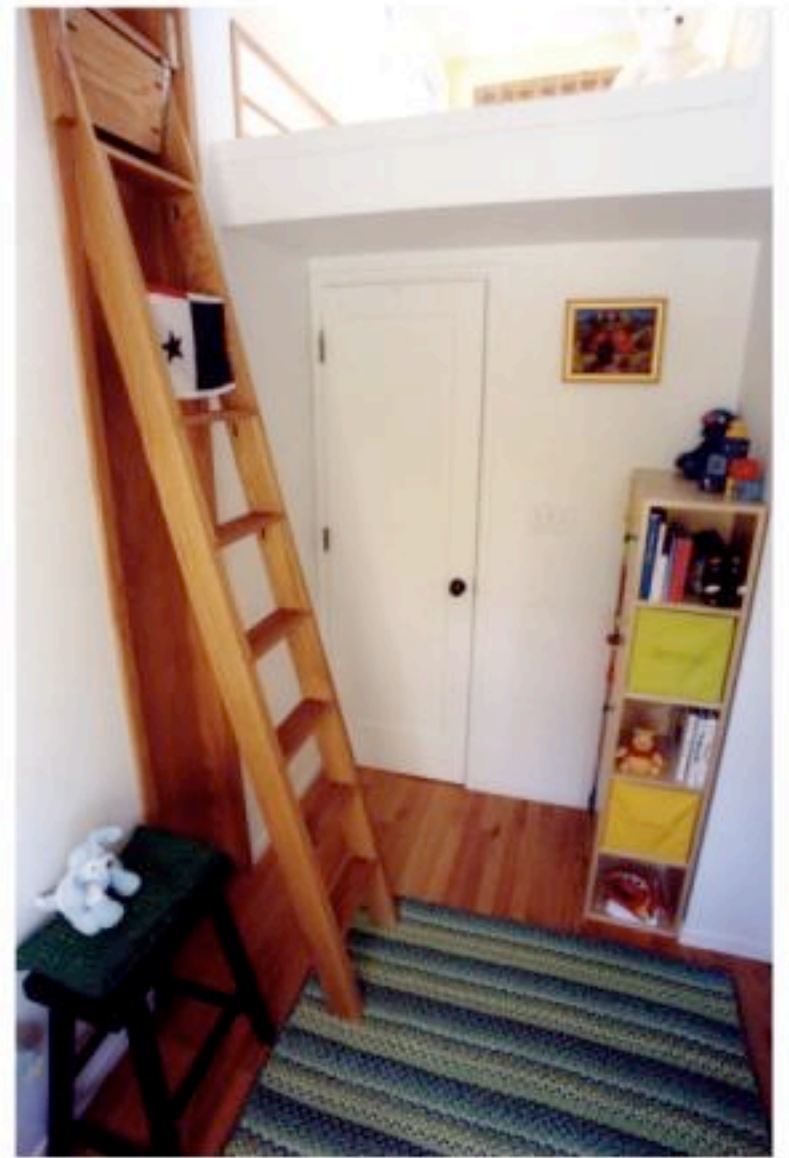
The new second floor adds a children's bedroom, a cozy sleeping loft in the belvedere, and master bedroom with hillside view.